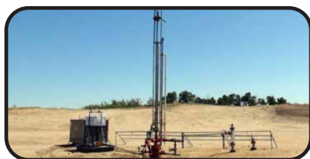
WELL HEAD EQUIPMENT

SilverJack built-in optimization capabilities allow for the freedom to quickly respond to changing flow dynamics without expensive and labour-intensive manual processes. The result is an intelligent artificial lift system that maintains peak efficiency while increasing production and decreasing downtime.